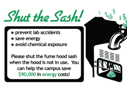
Fume hood stickers

Due to the magnitude of energy consumption in laboratories at UC Berkeley, Green Campus decided to present Tan Hall