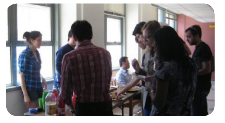
Wine and Cheese Party at Tan Hall

"If all occupants were to close their hoods when not in use, annual savings could accumulate to 32,760 KWh and 2,420 therms of energy and $5,696."