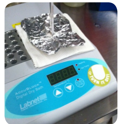
Turn it off sticker