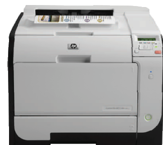
HP LaserJet Pro 400 color Printer M451dw