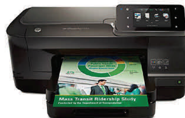
HP Officejet Pro 251dw