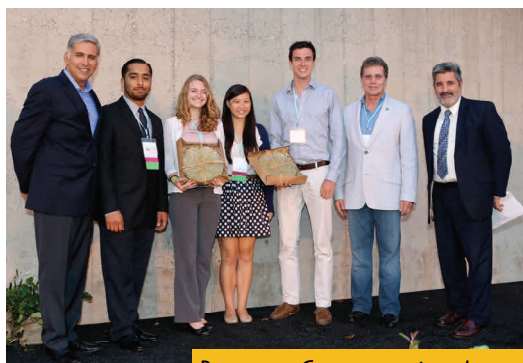
Powersave Campus receives the student sustainability award for UC.

At the conference, UC Berkeley was recognized for its exemplary work in developing sustainable practices. The conference aims to bring together all the higher education systems in California so that they can share sustainable ideas and encourage other campuses to implement similar programs."